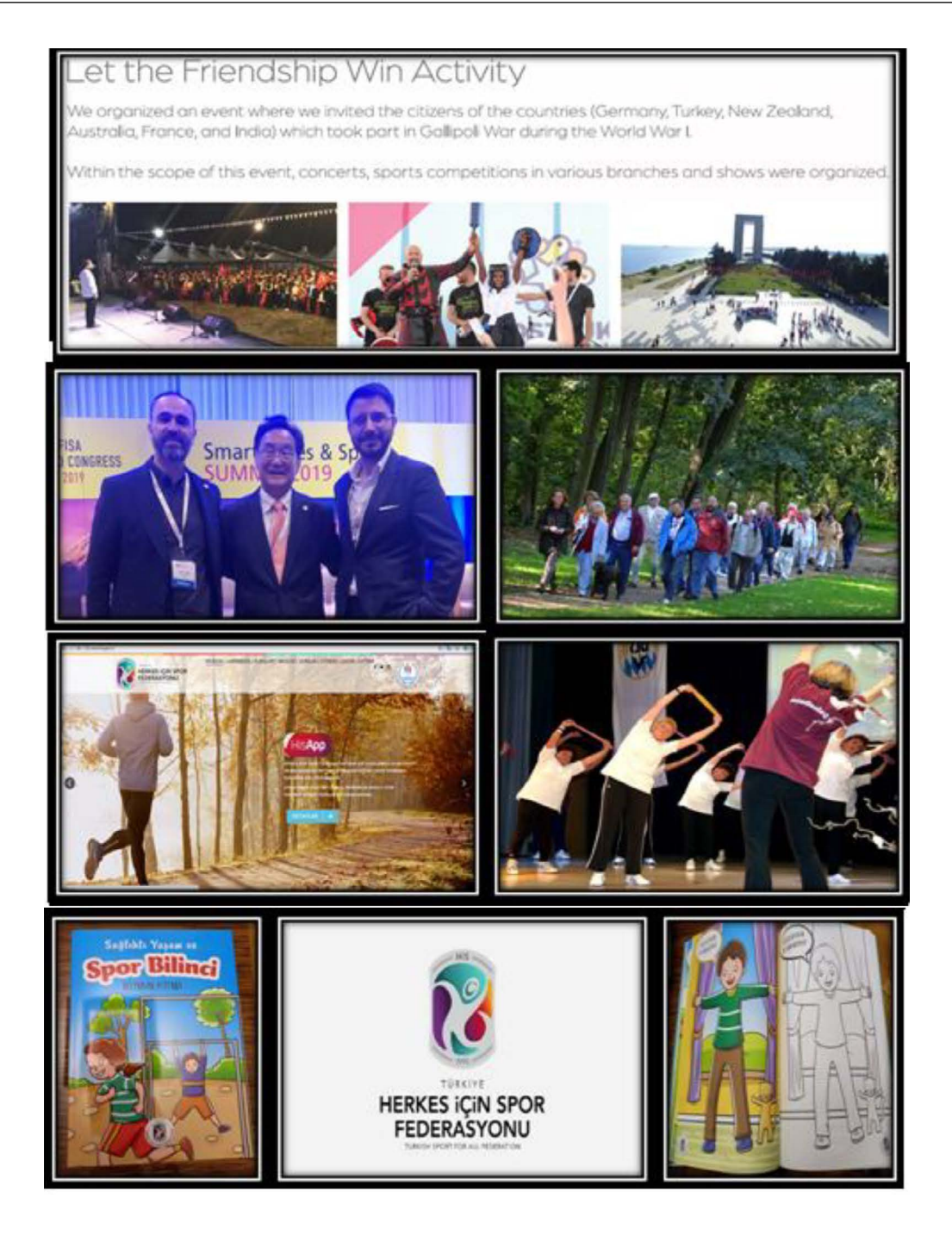
Figure 3 - Scenes from national sports events held in Turkey

Conclusion. "Some people spend their whole lives doing the impossible. And some don't want to take a minute to do what they can." (Nuwit Osmay). Not everyone can afford to go in for specialized or professional sports. However, all healthy people have the opportunity to exercise.