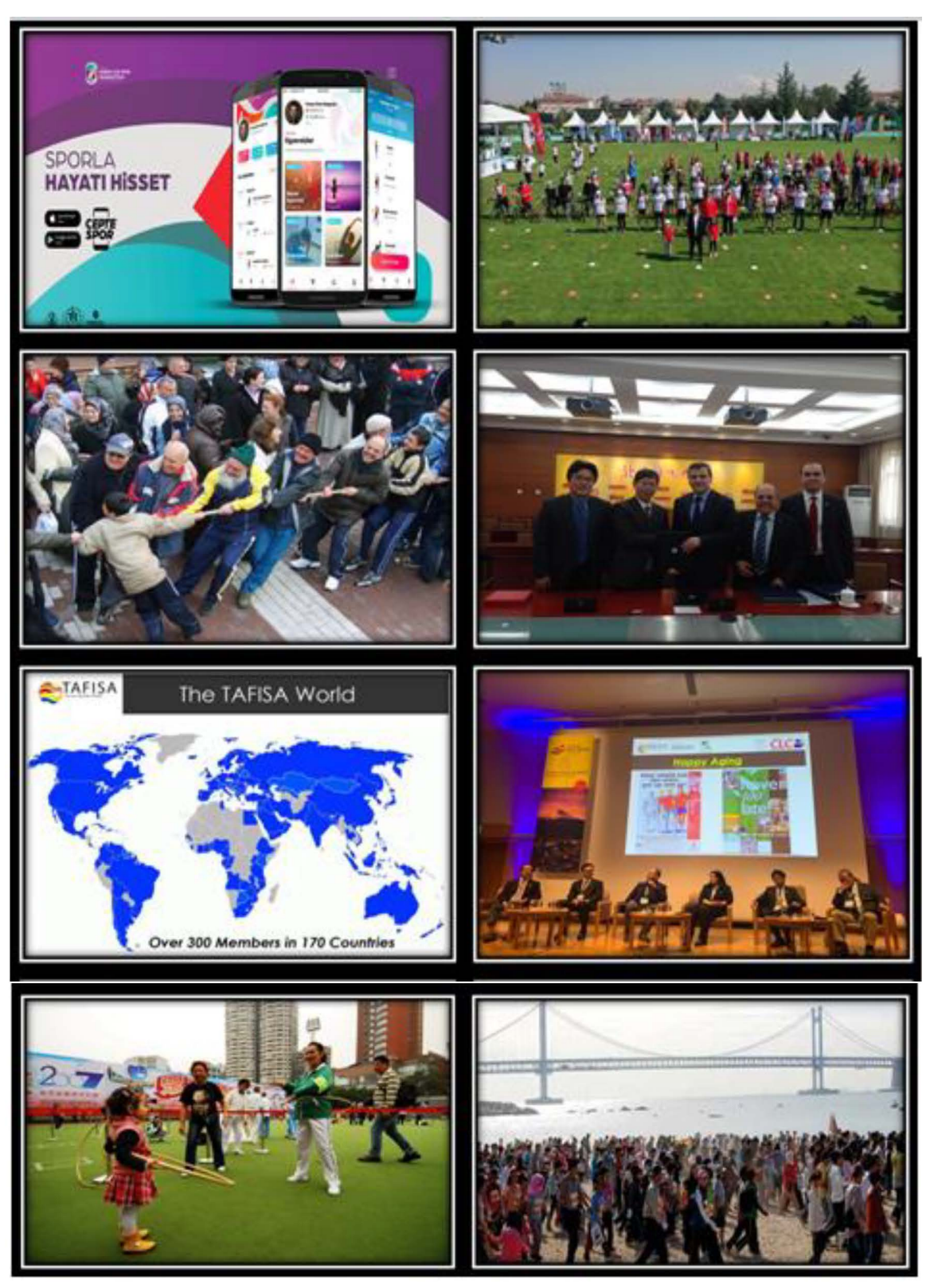
Figure 2 - Scenes from international sports events held in Turkey